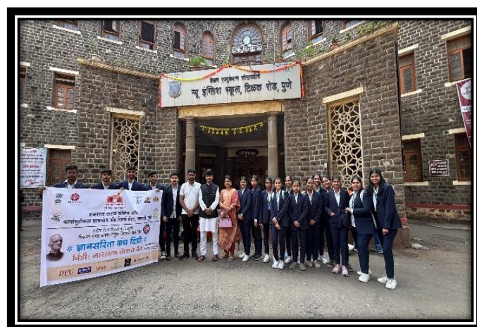
Glimpse of Dnyansarita Granth Dindi