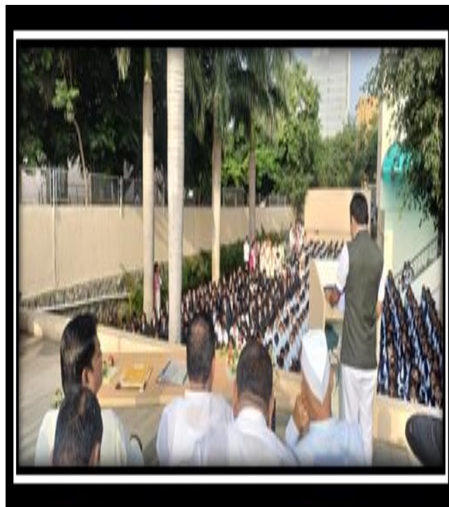
Flag hoisting on Independence Day