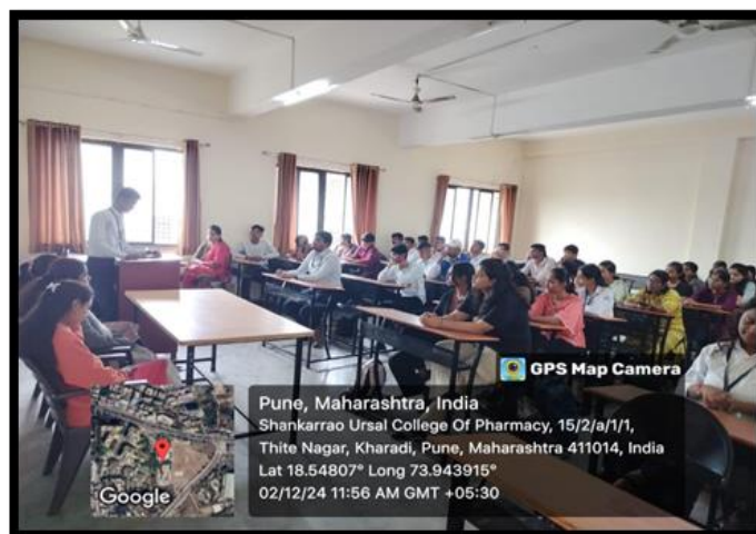
Glimpse of celebration of world AIDS day