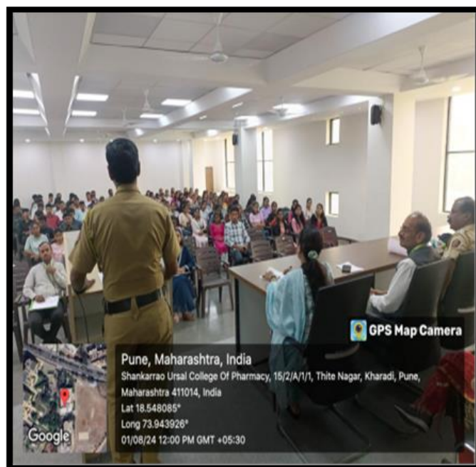
Active Participation of students in the Seminar