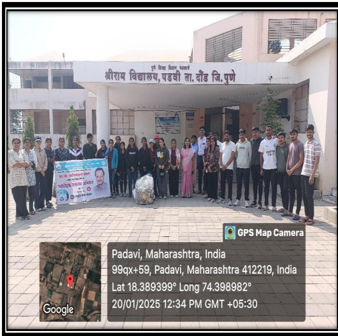
Plastic collection drive activity was conducted in the Shiram Vidalya Padvi