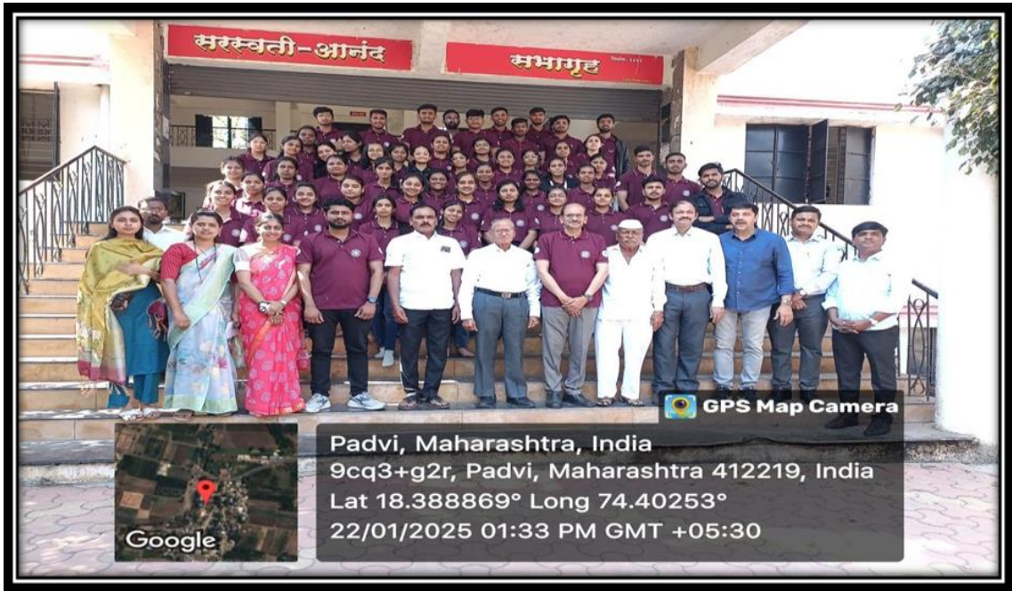
Group Photo of all staff members and NSS Volunteers