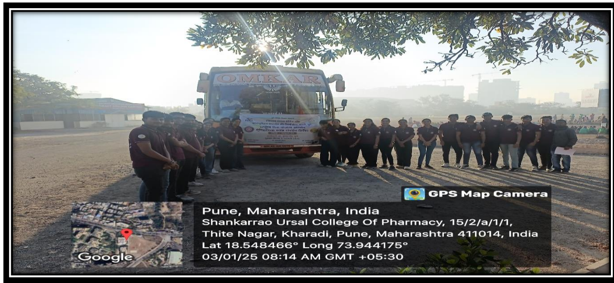
Way to Malhargadh from College