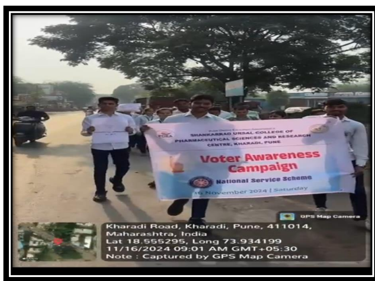
Glimpse of voting awareness campaign rally