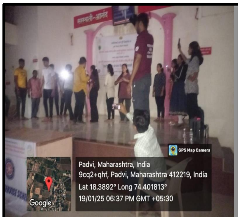
Hypnotism demonstration for students.