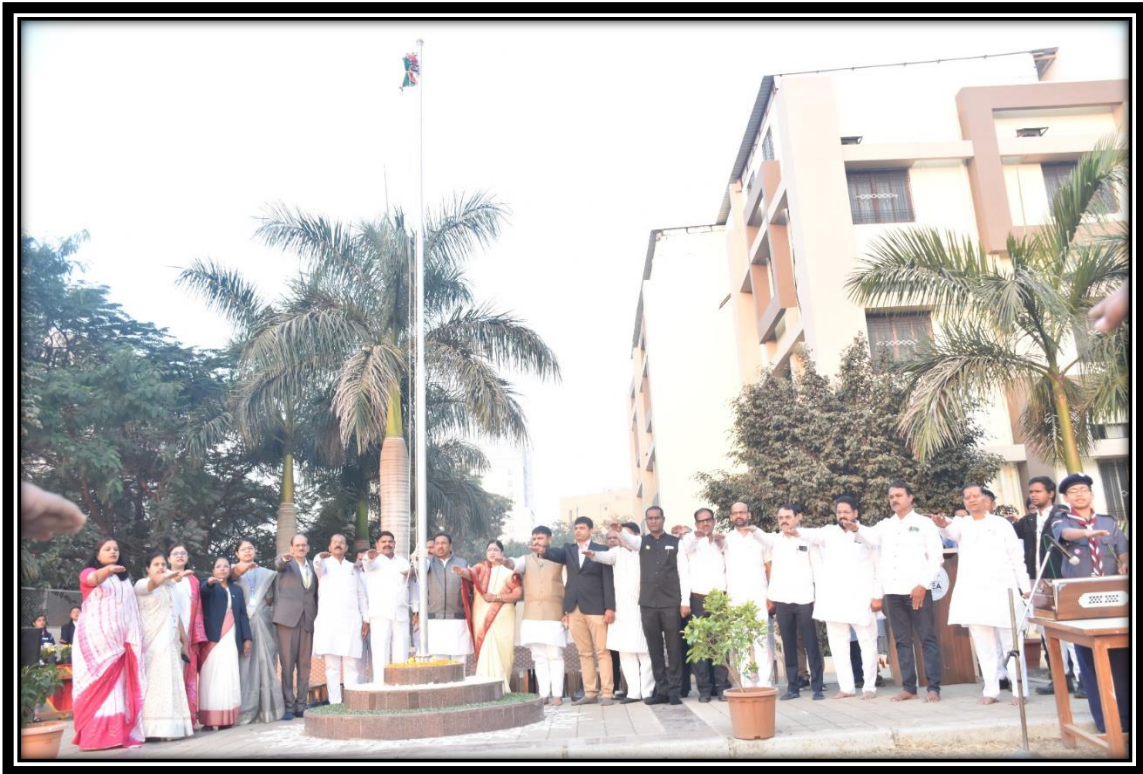
Republic Day Celebration in our College.