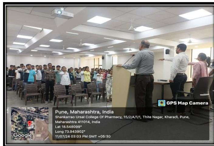
Students taking pledge for drug de-addiction