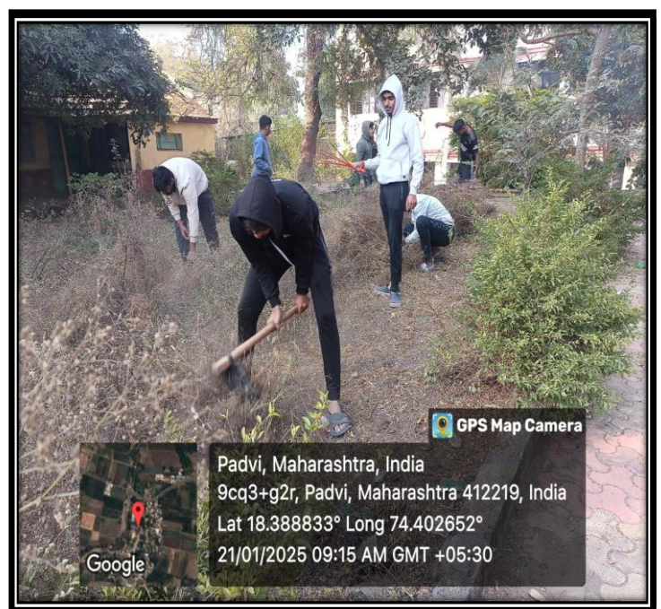
Volunteers cleaning the premises in front of Sarswati Anand auditorium hall