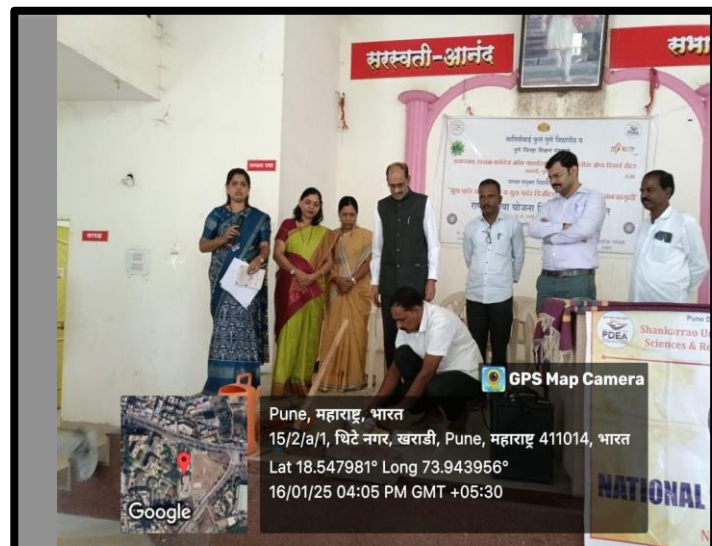
Inauguration and felicitation of guest at special seven days NSS Camp – At Padavi