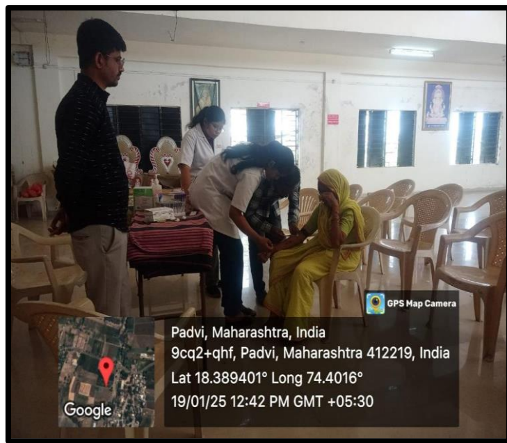
Health checkup camp by medical expertise from Vishwaraj Hospital organized by our college NSS Coordinators