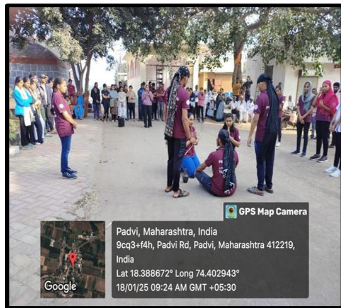
Students performing pathanaty for social awareness on women empowerment for the villagers