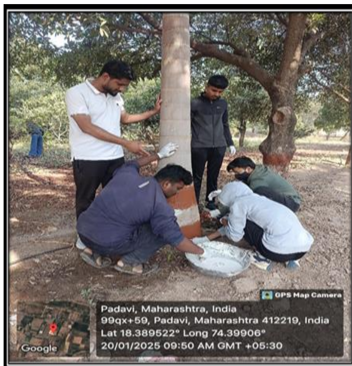
Tree Conservation activity was conducted in the Shiram Vidalya Padvi