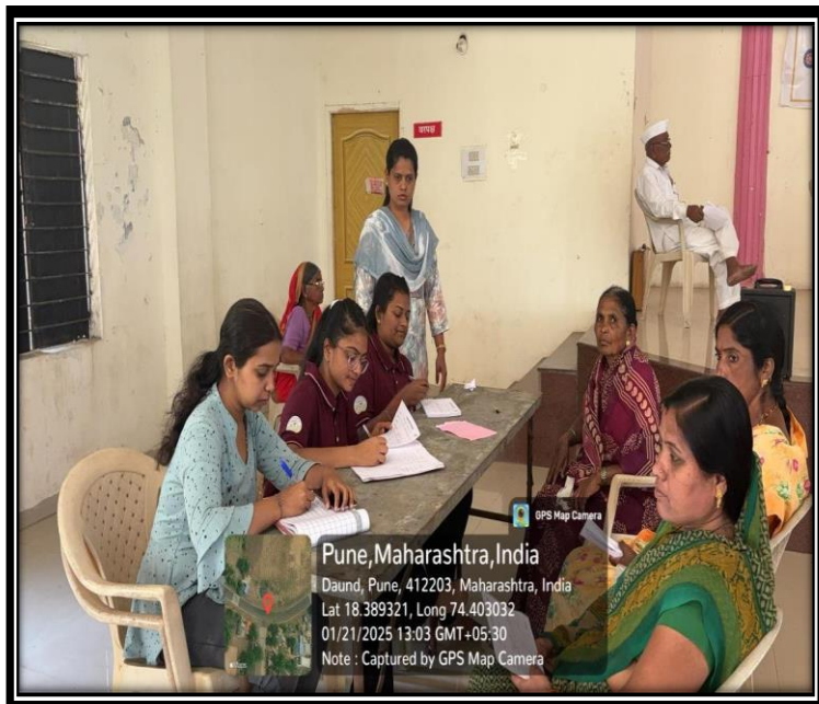
Registration counter for free eye checkup