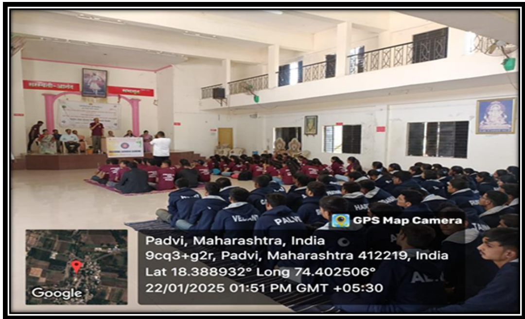
Principal Addressing to NSS Volunteers