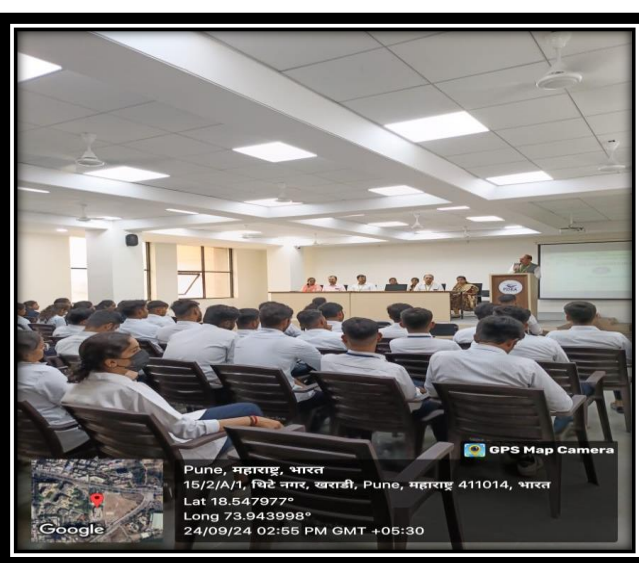
Glimpse on celebration of NSS foundation day