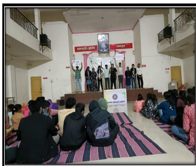
Audience enjoying the performances during the cultural program at village Padavi