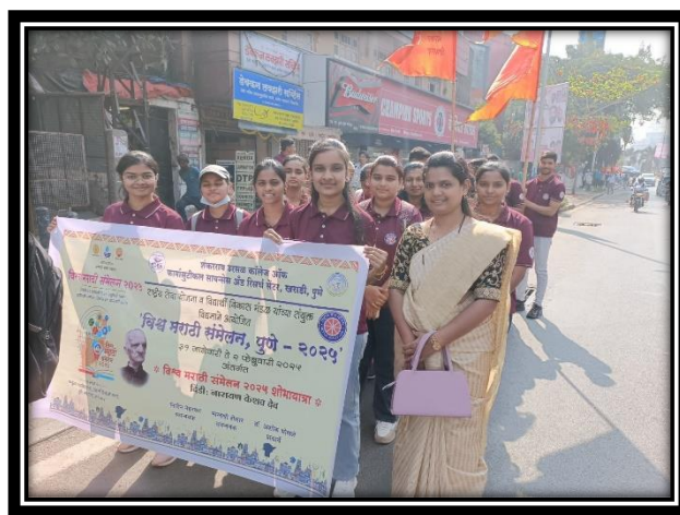
Padyatra from Balgandhrav Rangmanch to Ferguson College, Pune.