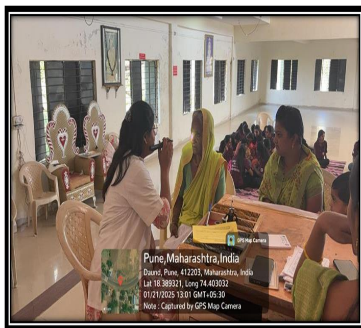
Doctors checking the eyes