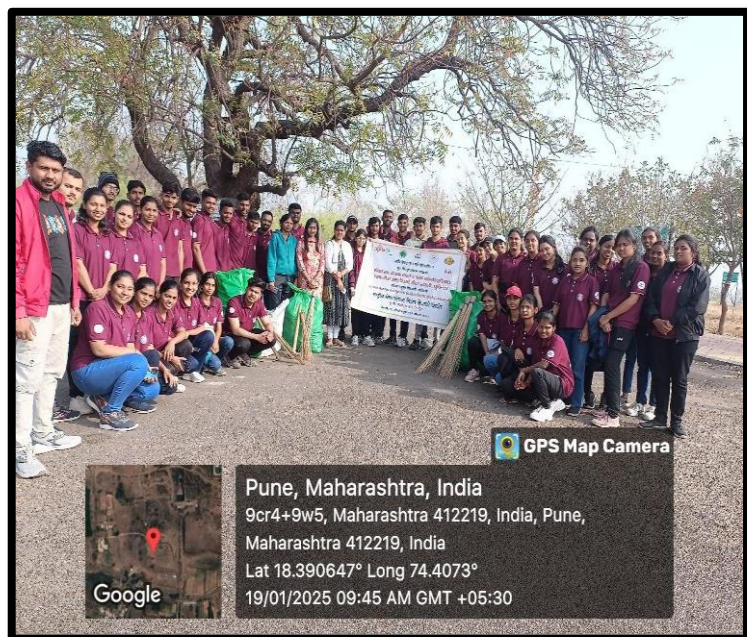
Cleanliness and Plastic collection done at Peer Tekadi premises